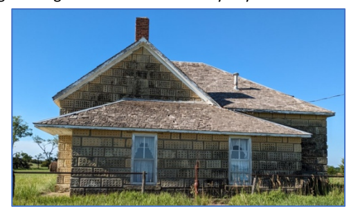
Notice the decorative stone facing on the wall facing the road? This is called "woodpeckering".

In the 60 years of its use, 300 pupils attended this school. Classes have not been held here since 1956. The building was eventually used for social gatherings as it was in those early days.